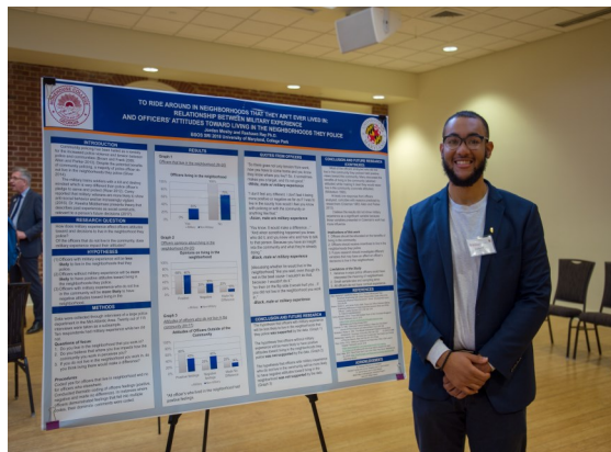
2018 Summer Research Initiative Poster Session

Status Notification: Approximately April, 2019