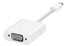
Apple HDMI/VGA connector

* Connecting a device via MAC requires using the HDMI/ VGA connector located in the front of the classroom, along with bringing your own Apple HDMI/VGA connector. *