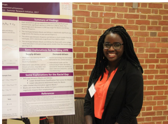
2017 Summer Research Initiative Poster Session

Status Notification: Approximately April, 2018